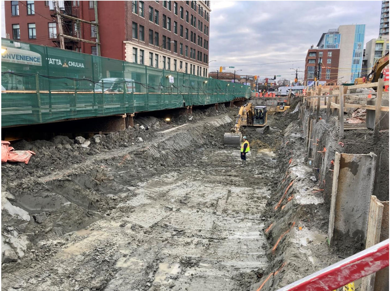
Figure 3: Mount Pleasant Station: Progressing with the excavation and shoring of the station box and headhouse.