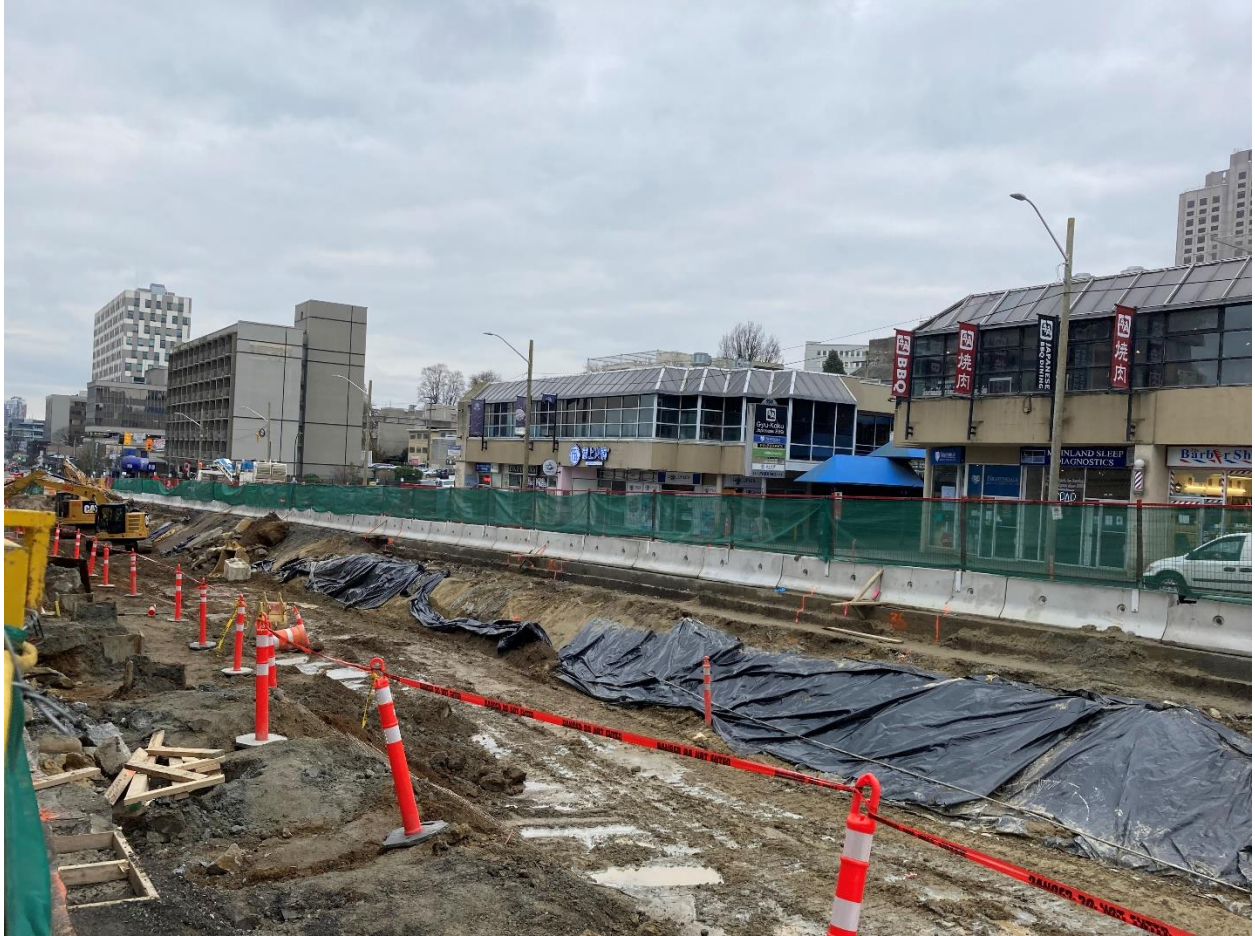
Figure 5: Oak VGH Station: Progressing with the Traffic deck excavation that will span from Laurel St to Oak St.