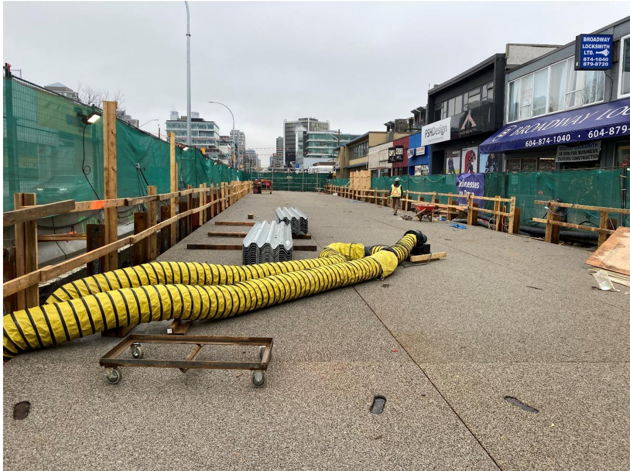
Figure 4: Broadway City Hall Station: Progressing with the installation of traffic decking from Alberta St to Cambie St.