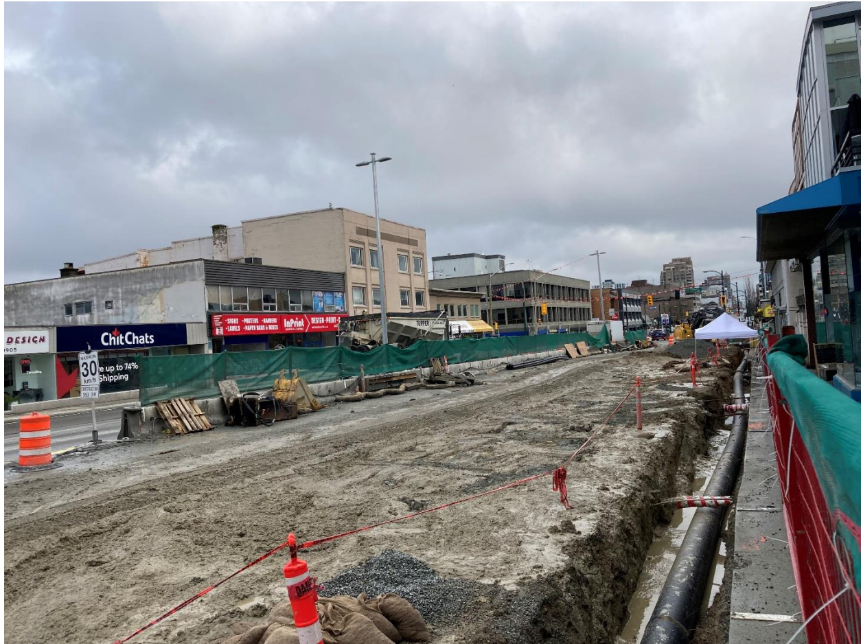
Figure 6: Arbutus Station: Progressing with the installation of a temporary water main prior to starting the excavation of the Traffic deck that will span from Cypress St to Arbutus St.