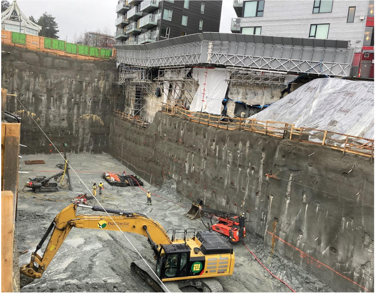
Figure 2: Great Northern Way-Emily Carr Station: Progressing with excavation of the elevated guideway transition into the station box and preparation of the headwall for the tunnels.