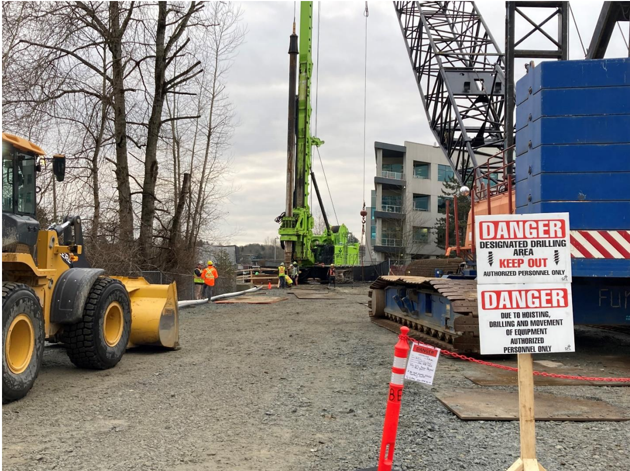
Figure 1: Elevated Guideway: Installation of the first caisson.