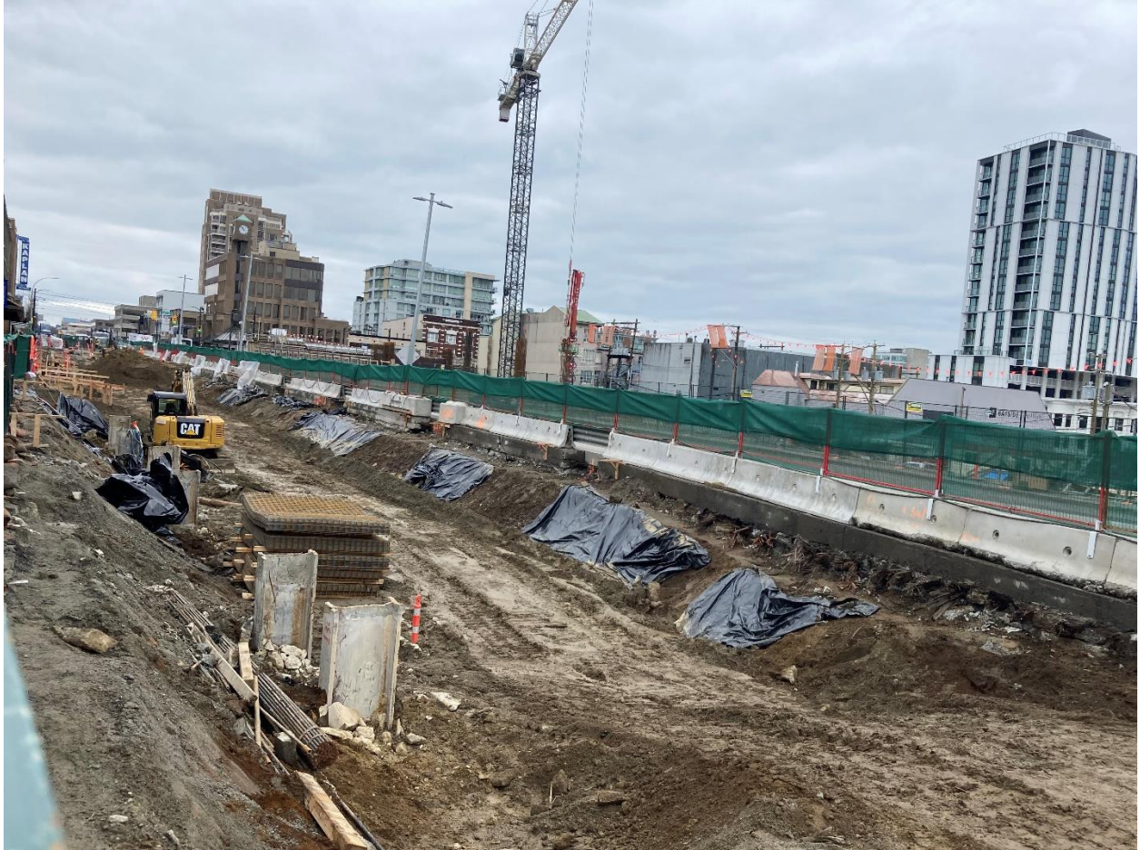
Figure 6: South Granville Station: Progressing with the Traffic deck excavation that will span from Hemlock St to Granville St.