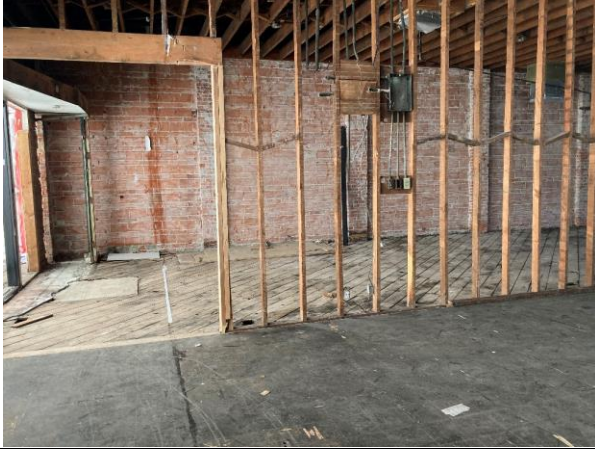
South Granville Station March 30, 2021. Progressing with removal of internal building materials.