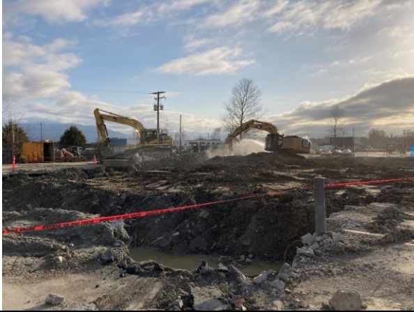
Great Northern Way Station March 30, 2021. Progressing with demolition work.