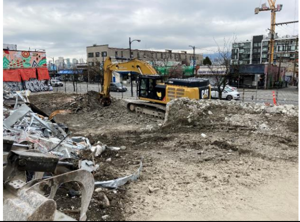
Mt. Pleasant Station March 23, 2021. Progressing with demolition work.