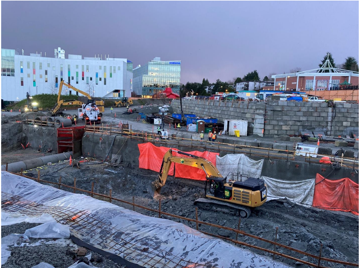
Figure 1: Great Northern Way-Emily Carr Station: Progressing with excavation, installation of wall anchors and piles.