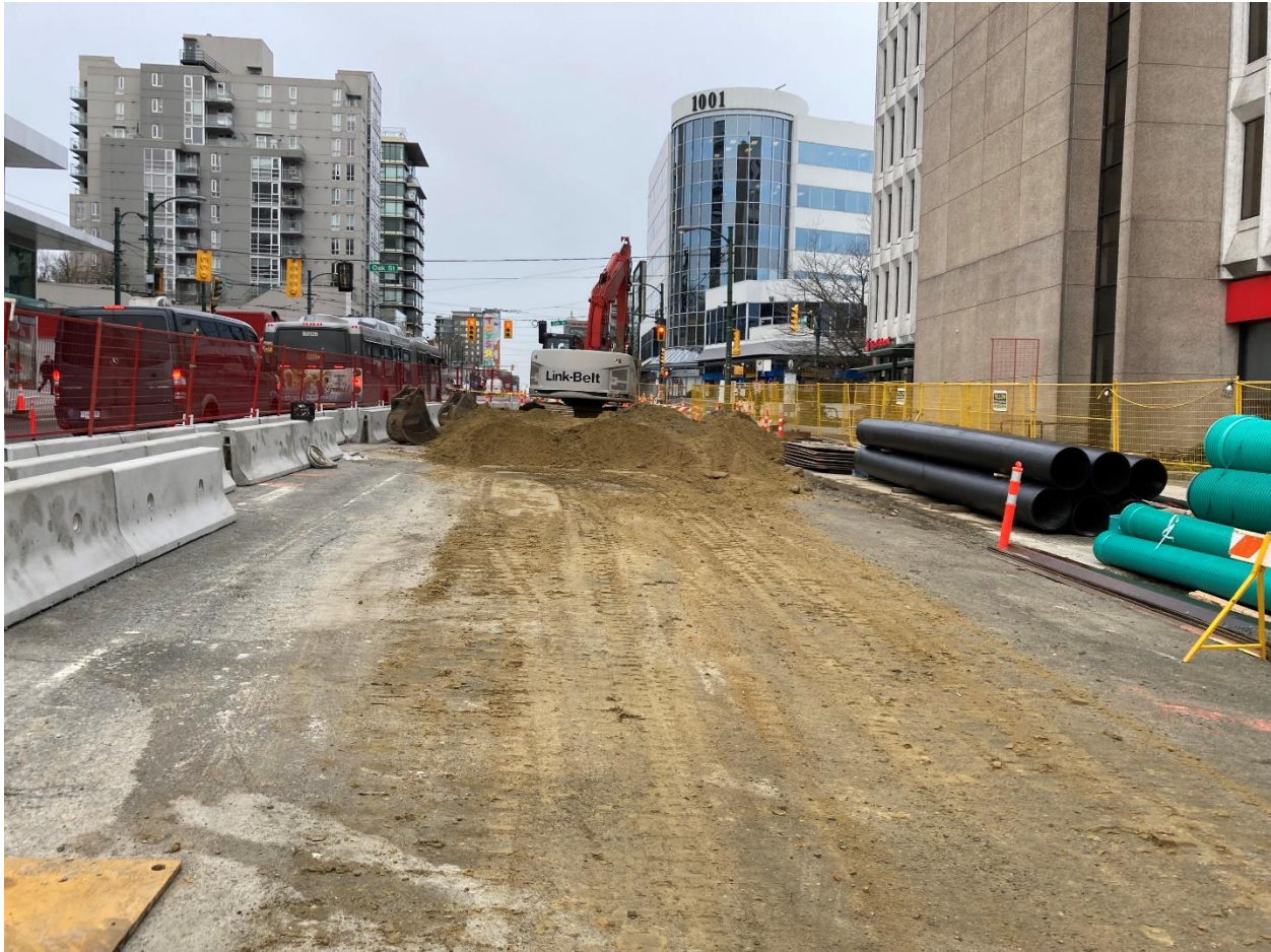
Figure 4: Oak VGH Station: Progressing with the relocation of underground utilities and installation of temporary utilities.