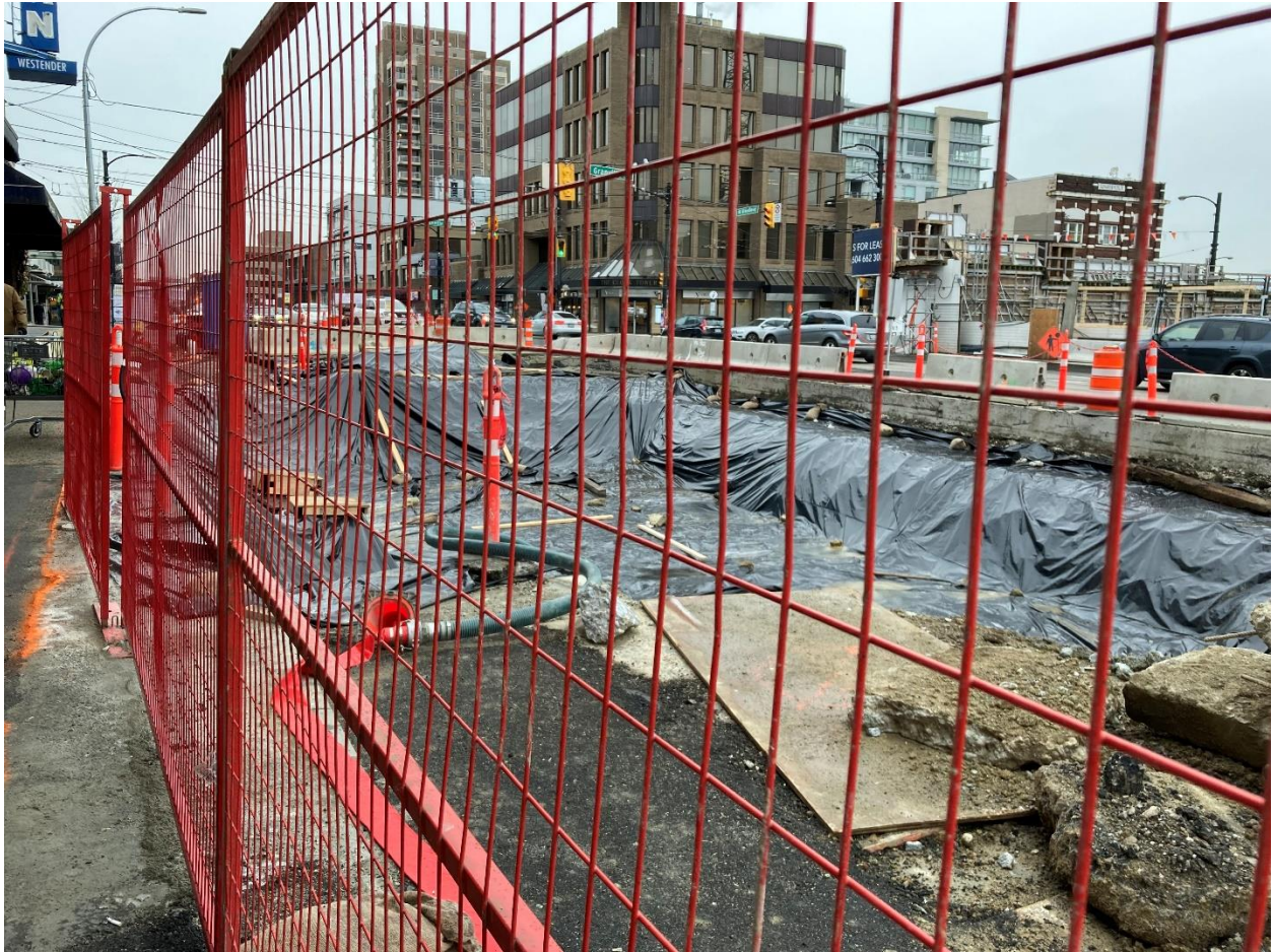
Figure 5: South Granville Station: Progressing with the excavation of the station box near the south-east corner of W. Broadway and Granville street..