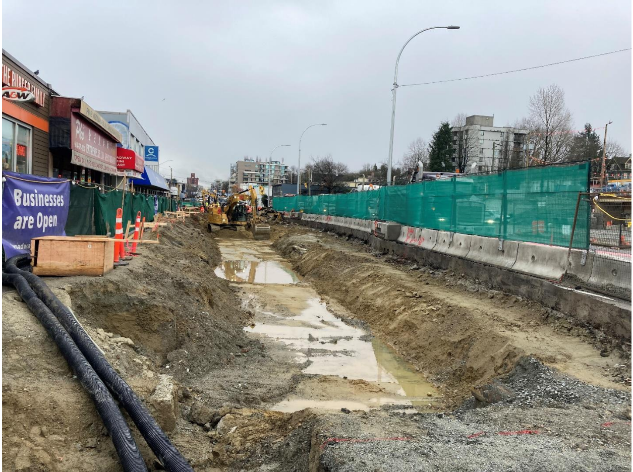
Figure 3: Broadway City Hall Station: Progressing with the excavation of the station box near the north-east corner of W. Broadway and Cambie street.