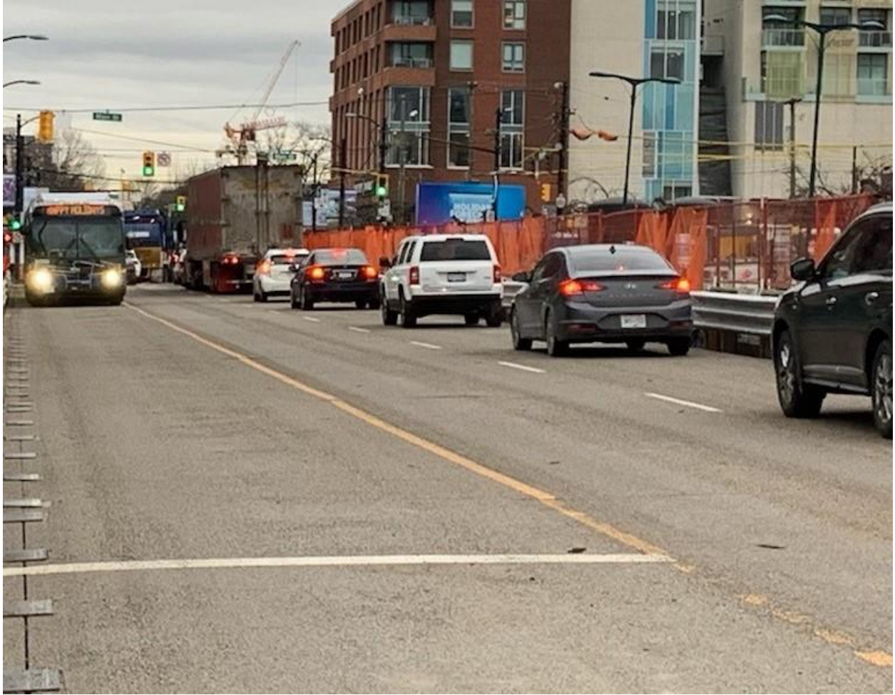
Figure 2: Mount Pleasant Station: Traffic decking installed on the north side of W. Broadway from Main to Quebec street.