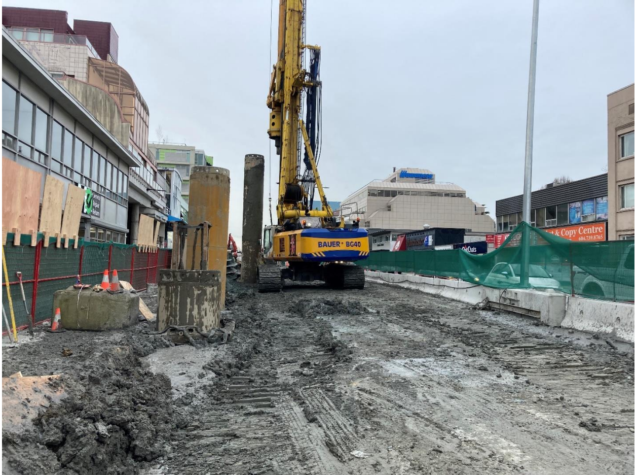
Figure 6: Arbutus Station: Progressing with the installation of piles for the traffic decking.