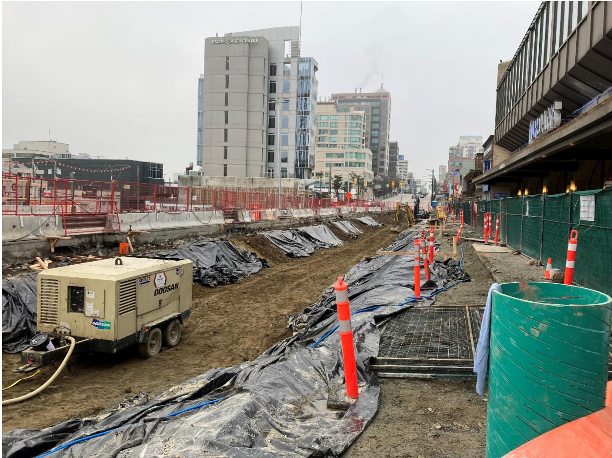
Figure 6: South Granville Station: Progressing with the excavation of the station box that will span from Hemlock St to Granville St.