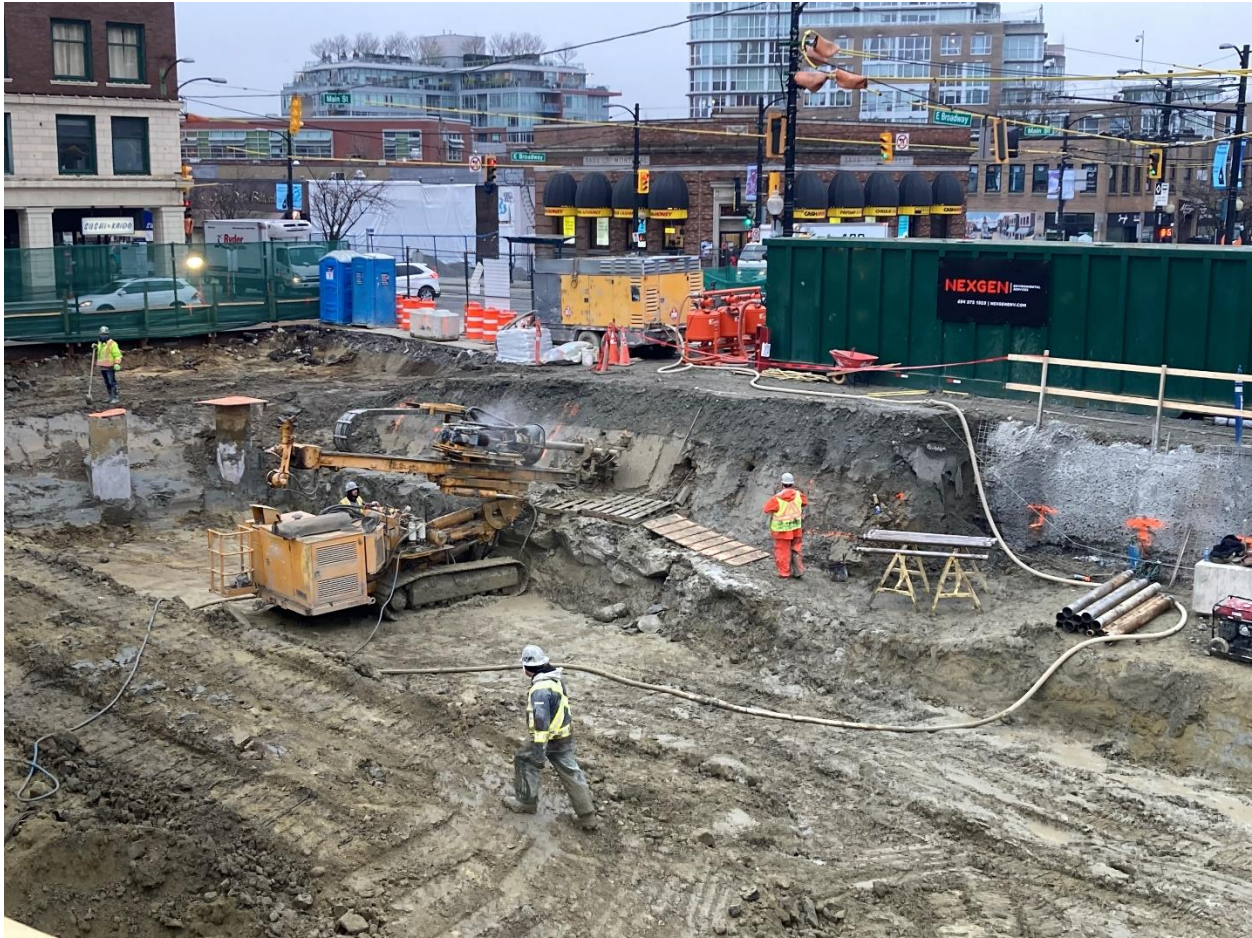
Figure 3: Mount Pleasant Station: Progressing with the excavation and shoring of the station box and headhouse.