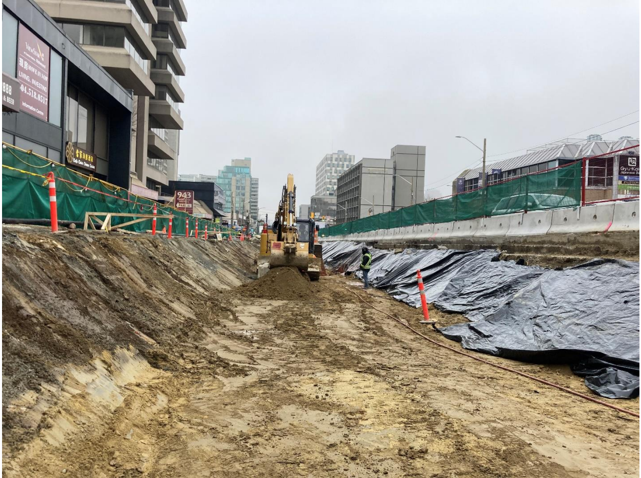
Figure 5: Oak VGH Station: Progressing with the station box excavation that will span from Laurel St to Oak St.