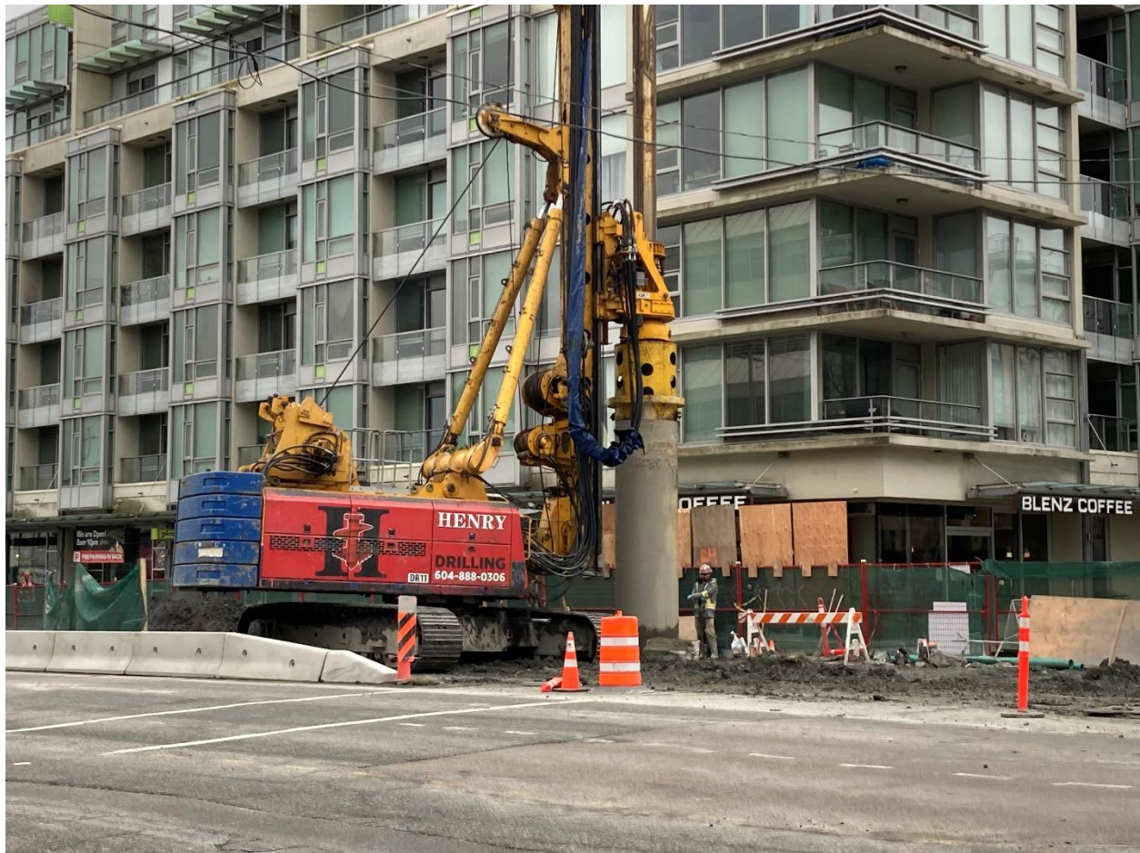
Figure 6: Arbutus Station: Progressing with the installation of piles for the traffic decking.