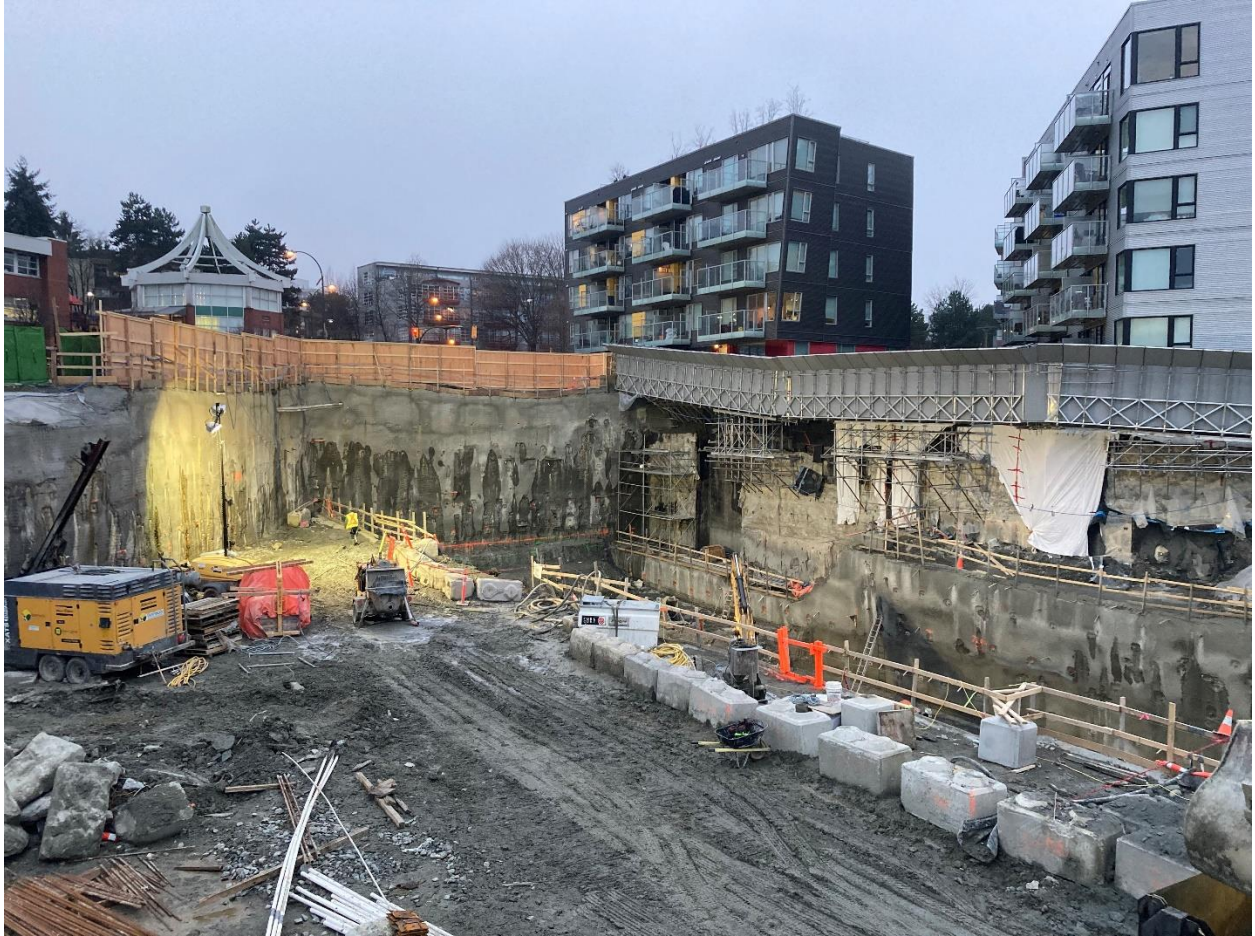
Figure 2: Great Northern Way-Emily Carr Station: Progressing with excavation of the elevated guideway transition into the station box and preparation of the headwall for the tunnels.