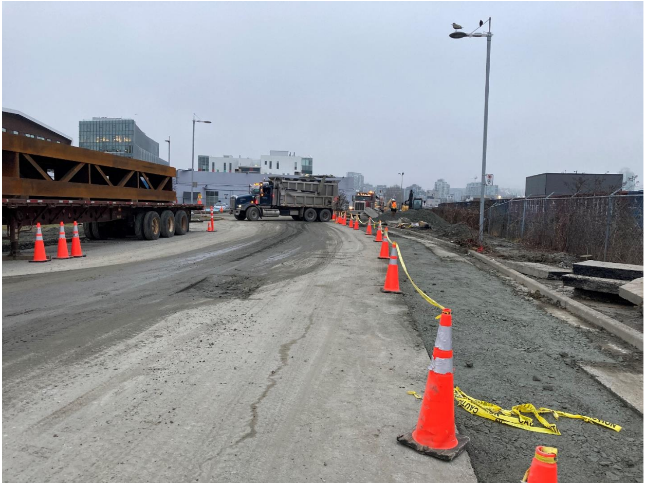
Figure 1: Elevated Guideway: Progressing with the relocation of underground utilities prior to the construction of the elevated guideway.