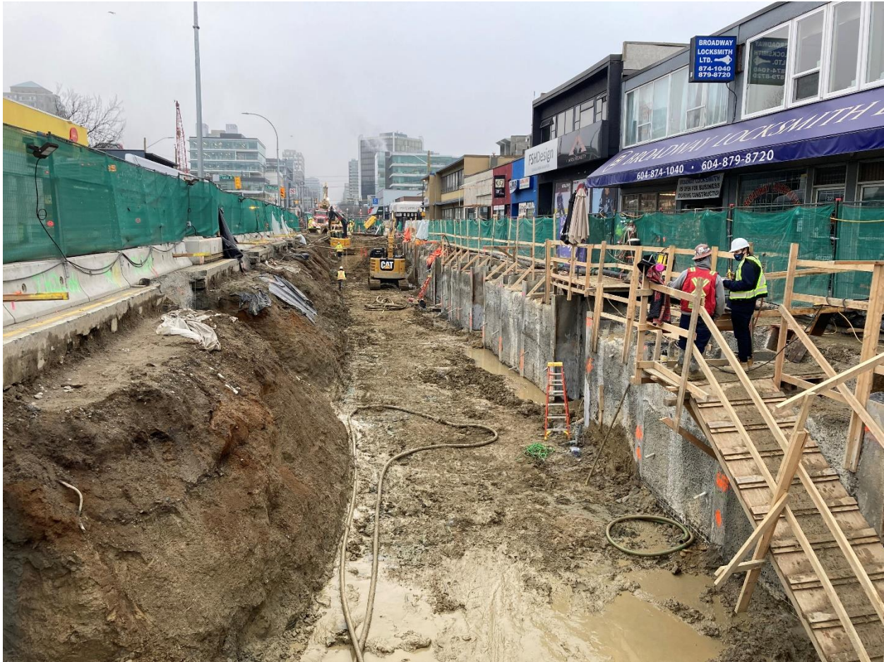
Figure 4: Broadway City Hall Station: Progressing with the excavations for the station box that will span from Alberta St to Cambie St.