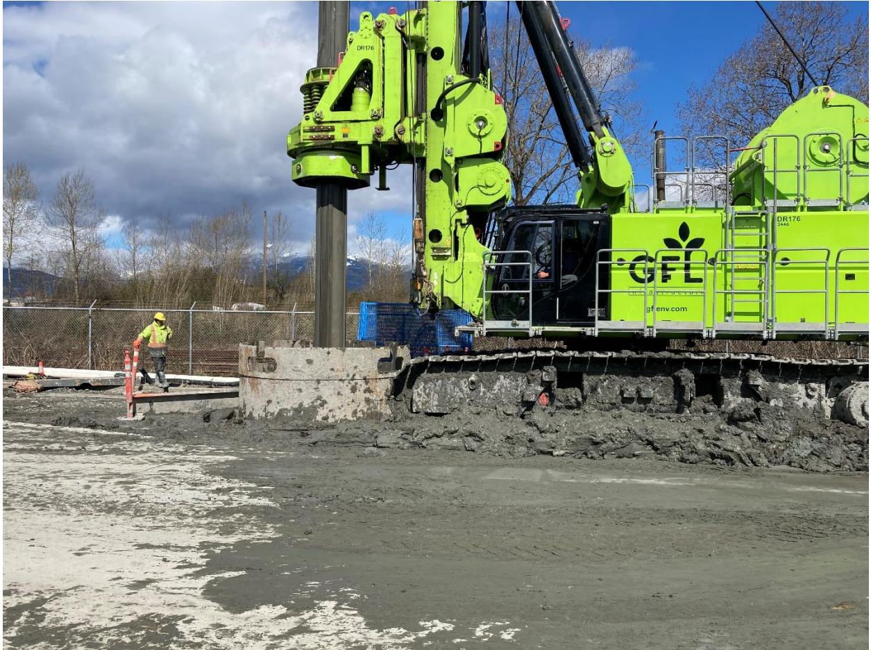
Figure 1: Elevated Guideway: Installation of caissons.