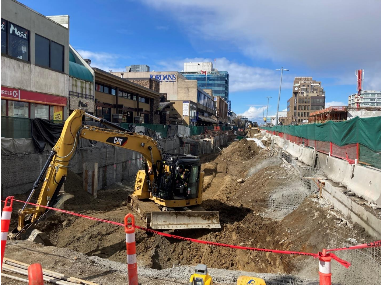
Figure 6: South Granville Station: Preparing to install the traffic deck that will span from Hemlock St to Granville St.