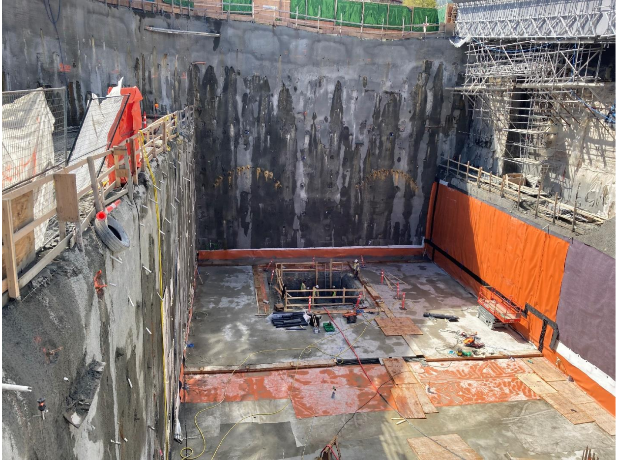
Figure 2: Great Northern Way-Emily Carr Station: Preparation for the arrival of the tunnel boring machines.