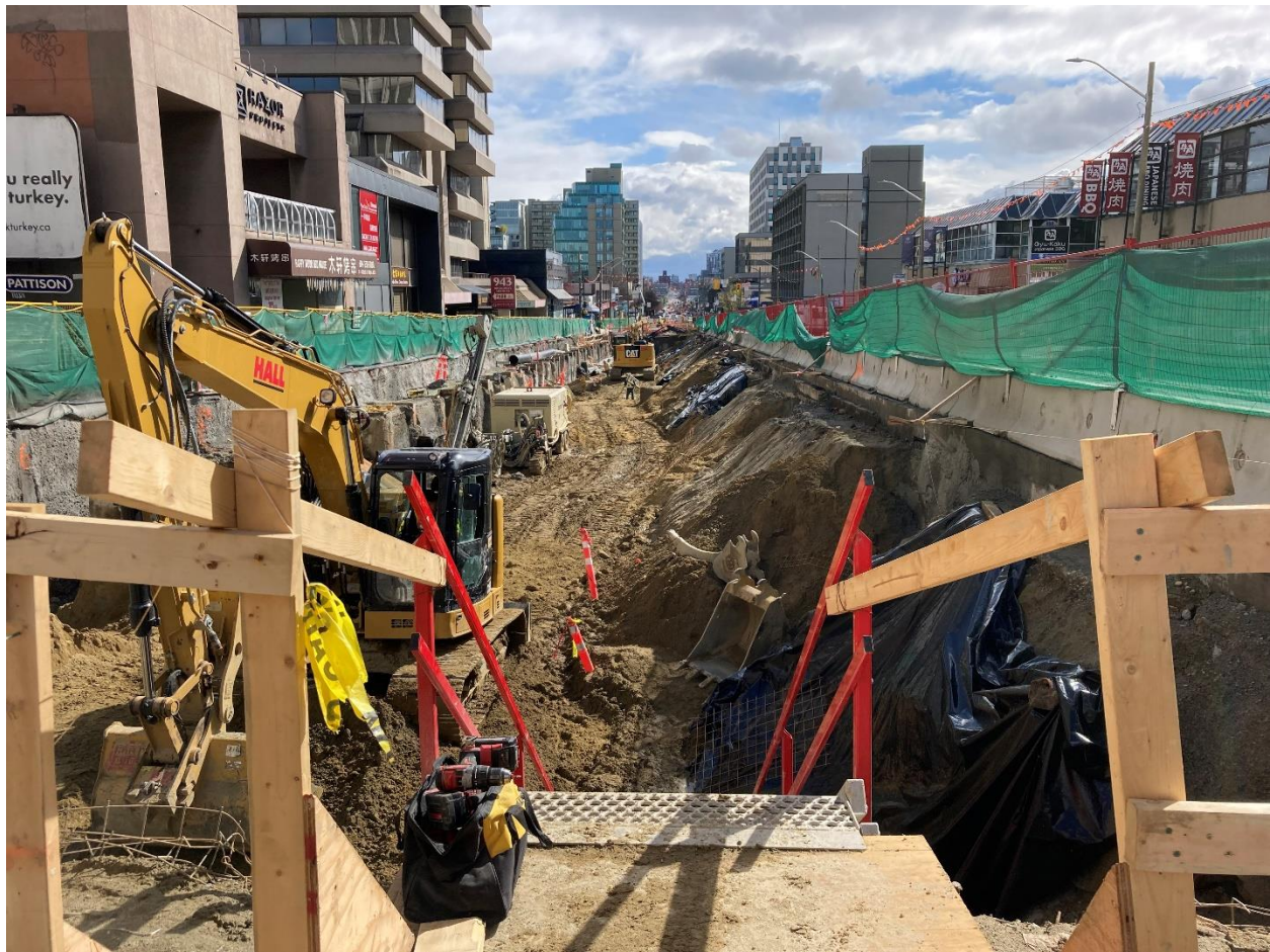
Figure 5: Oak VGH Station: Preparing to install the traffic deck between Laurel St and Oak St.