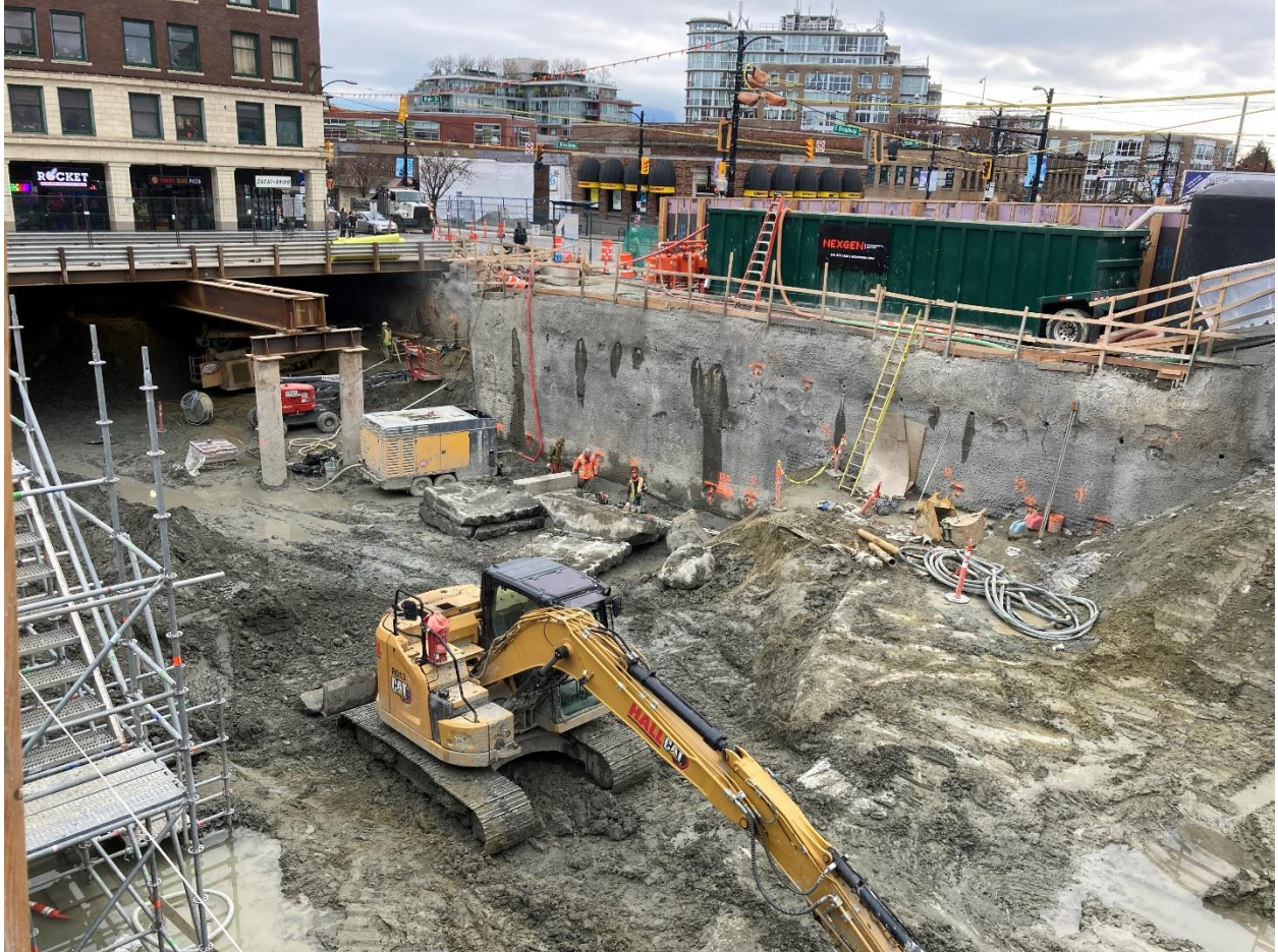
Figure 3: Mount Pleasant Station: Progressing with the excavation and shoring of the station box and headhouse.