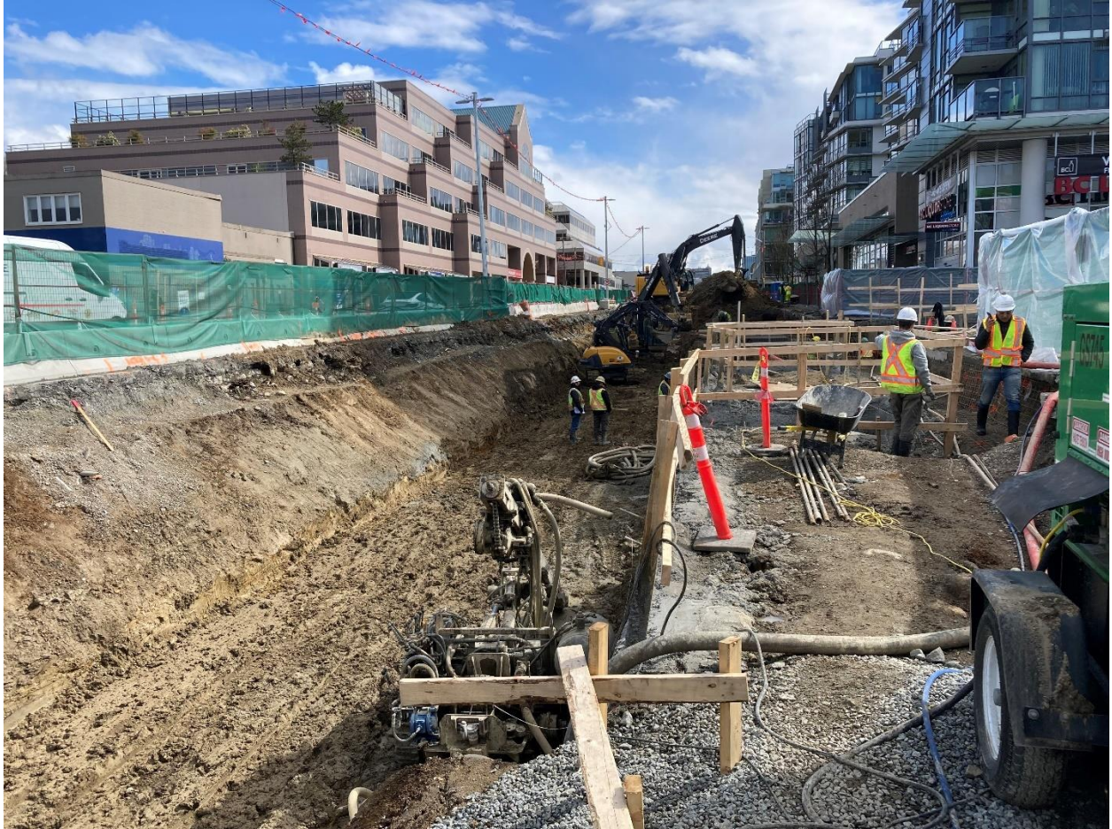
Figure 7: Arbutus Station: Preparing to install the traffic deck that will span from Arbutus St to Cypress St.