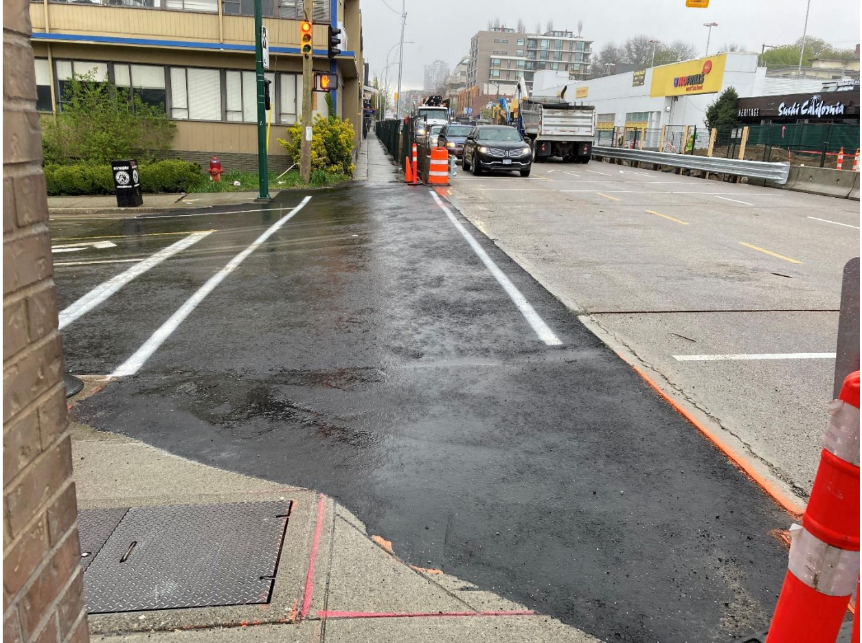
Figure 4: Broadway City Hall Station: Completion of the traffic decking along the north side on West Broadway, from Alberta Street to Cambie Street.