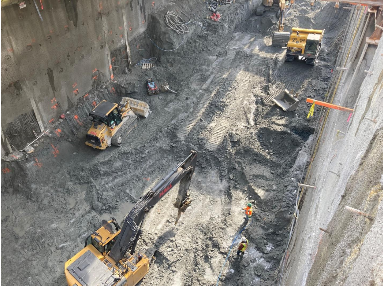
Figure 3: Mount Pleasant Station: Progressing with the excavation and shoring of the station box.