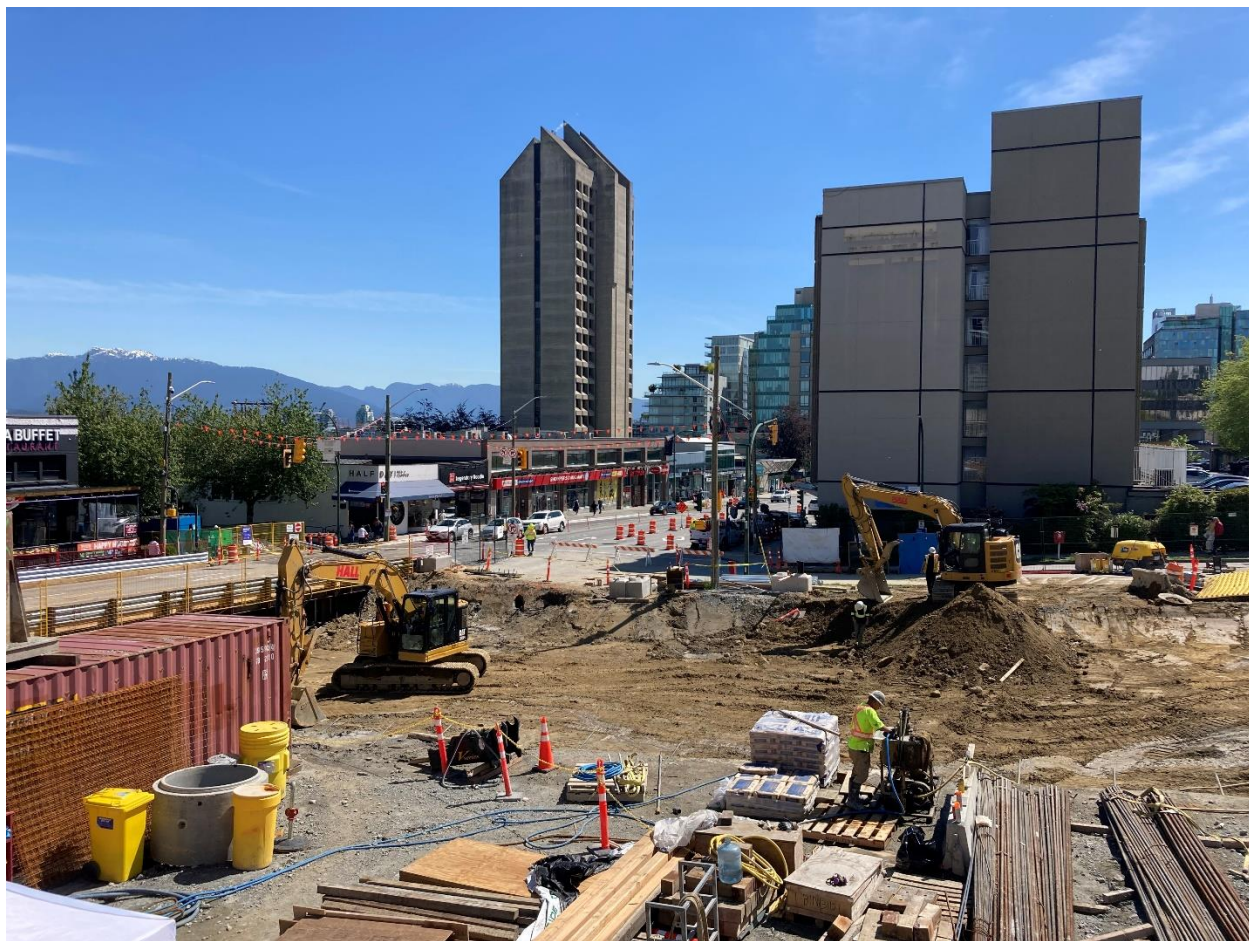
Figure 5: Oak VGH Station: Progressing with the excavation of the headhouse.