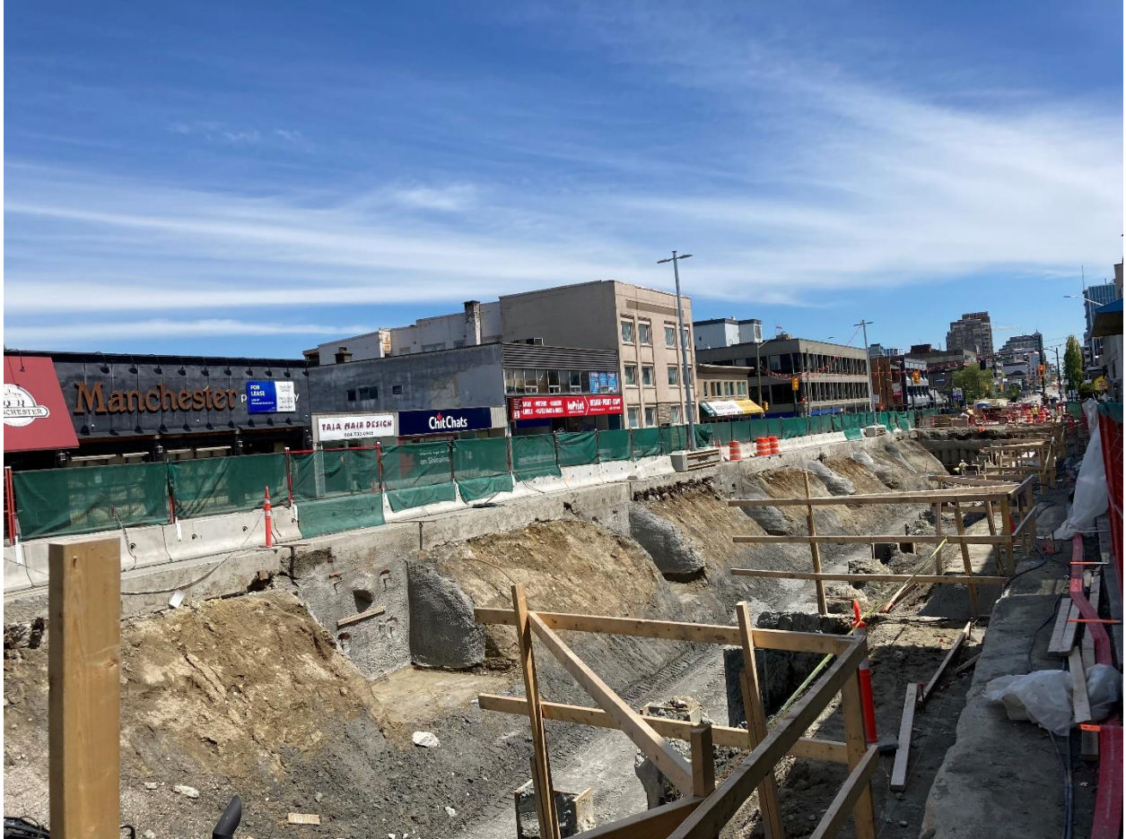
Figure 7: Arbutus Station: Progressing with the shallow excavation and shoring for the traffic deck.