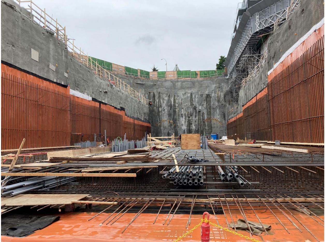
Figure 2: Great Northern Way-Emily Carr Station: Progressing with the installation of waterproof lining, conduit, and rebar for the station box.