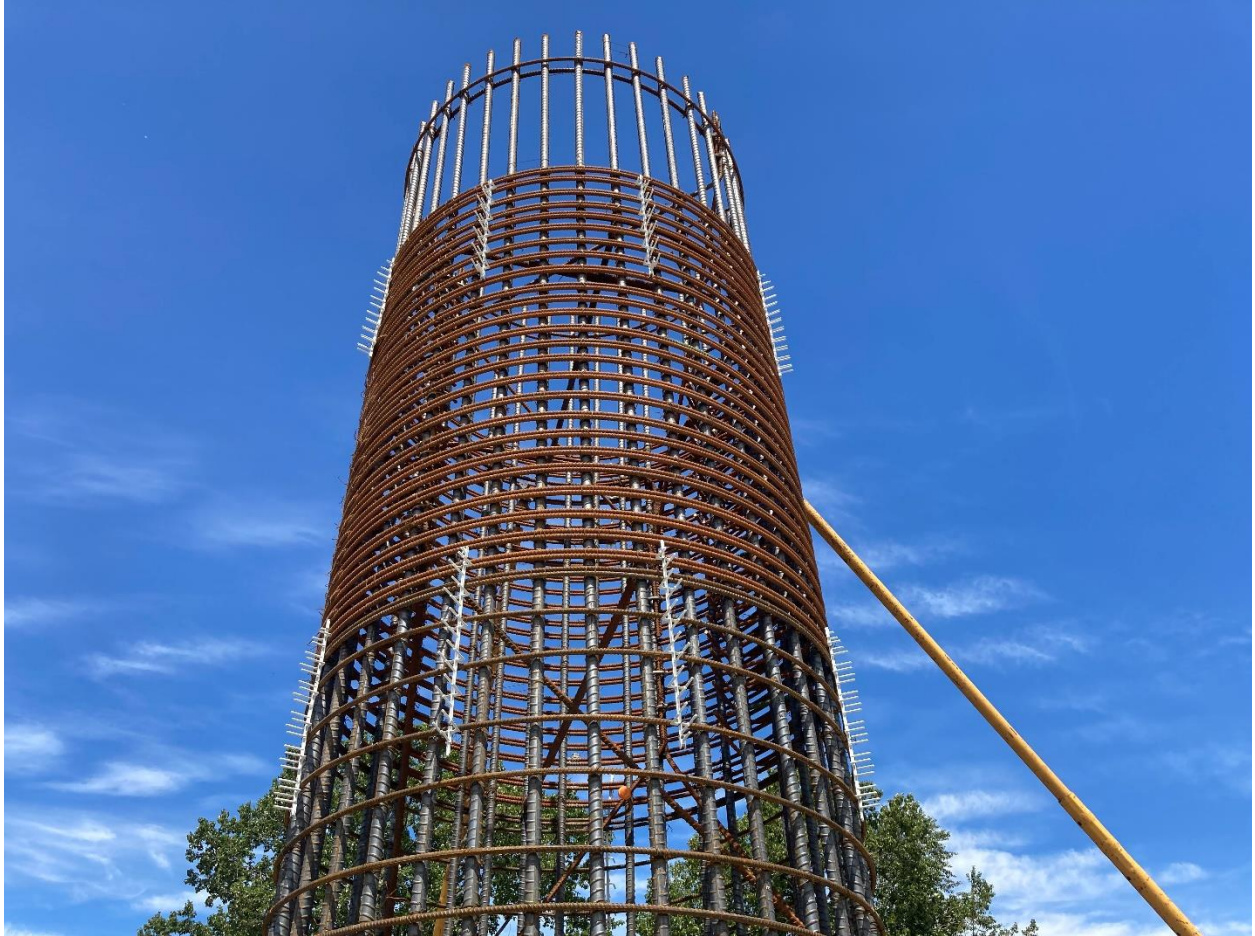
Figure 1: Elevated Guideway: Progressing with the installation of caissons for the elevated guideway columns.