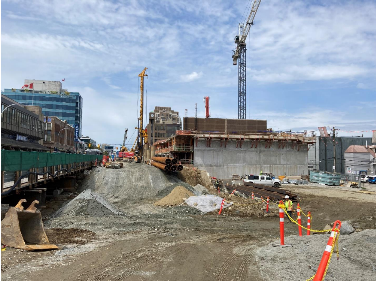
Figure 6: South Granville Station: Progressing with the installation of piles for the traffic decking that will span along the north side of W. Broadway.