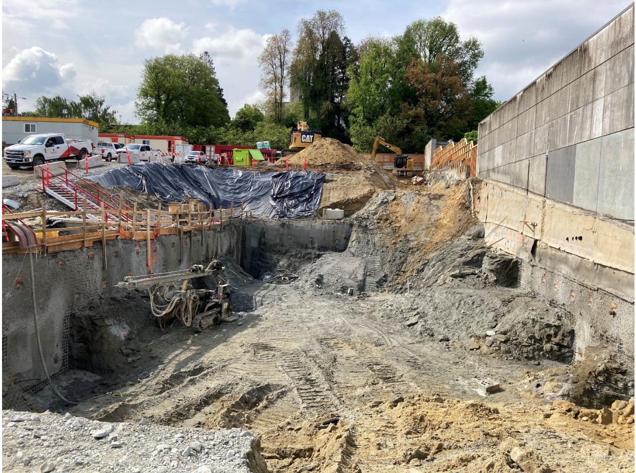
Figure 4: Broadway City Hall Station: Progressing with the excavation and shoring for the headhouse. begins.