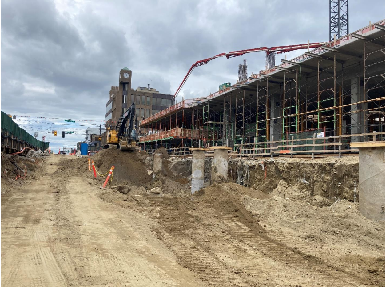
Figure 6: South Granville Station: Progressing with the excavation of the station box adjacent to the PCI development site.