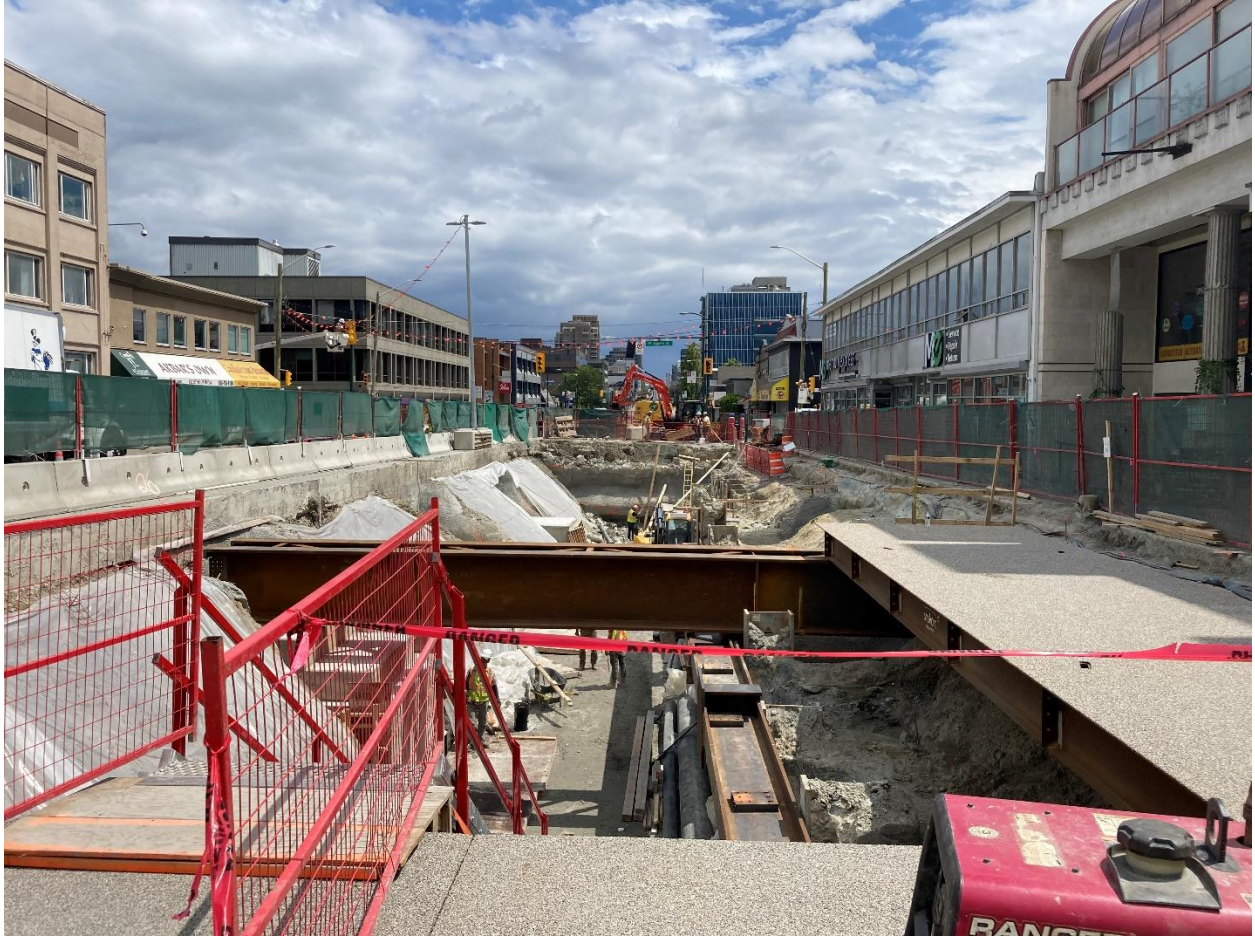
Figure 7: Arbutus Station: Progressing with the installation of traffic decking on Broadway between Arbutus and Cypress streets.