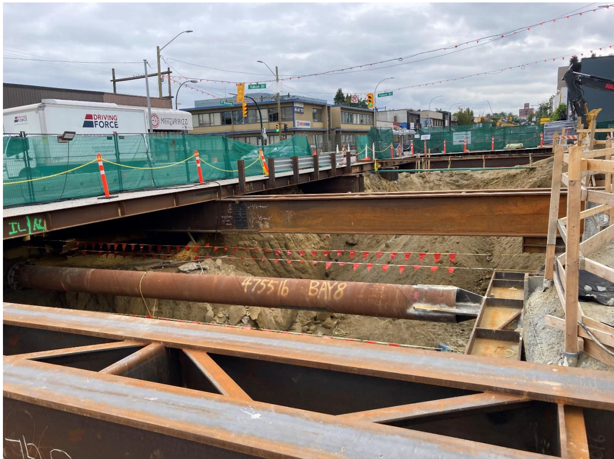
Figure 4: Broadway City Hall Station: Progressing with the excavation, shoring, and supports for the station box.