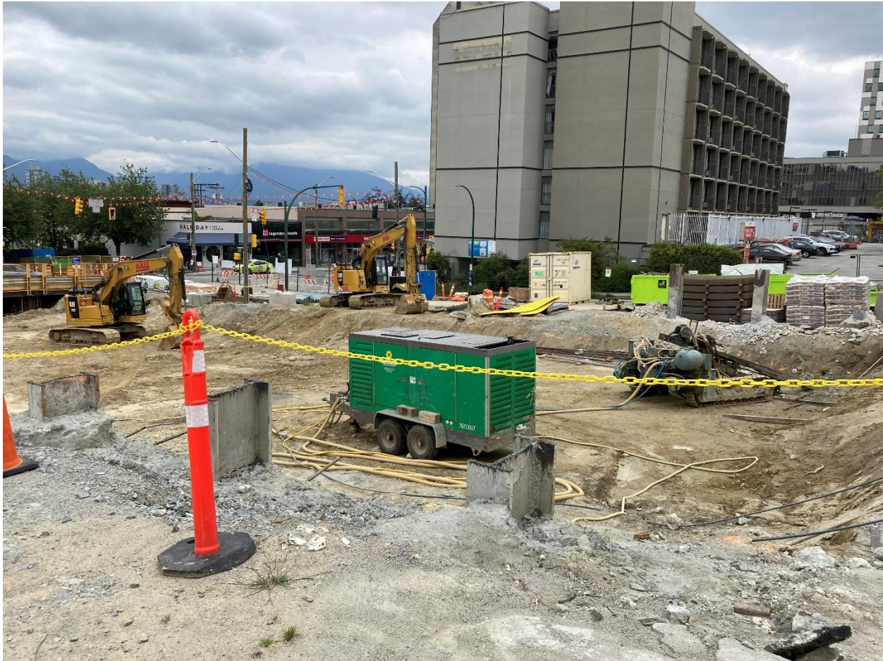
Figure 5: Oak VGH Station: Progressing with the excavation and shoring of the headhouse.