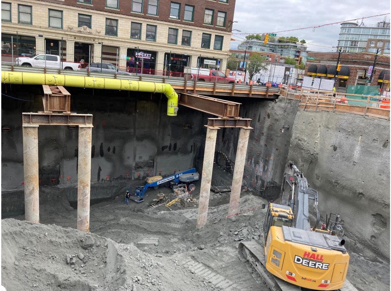
Figure 3: Mount Pleasant Station: Progressing with the excavation and shoring of the station box and headhouse.