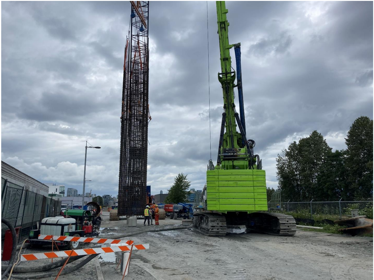
Figure 1: Elevated Guideway: Framework for the elevated guideway columns.