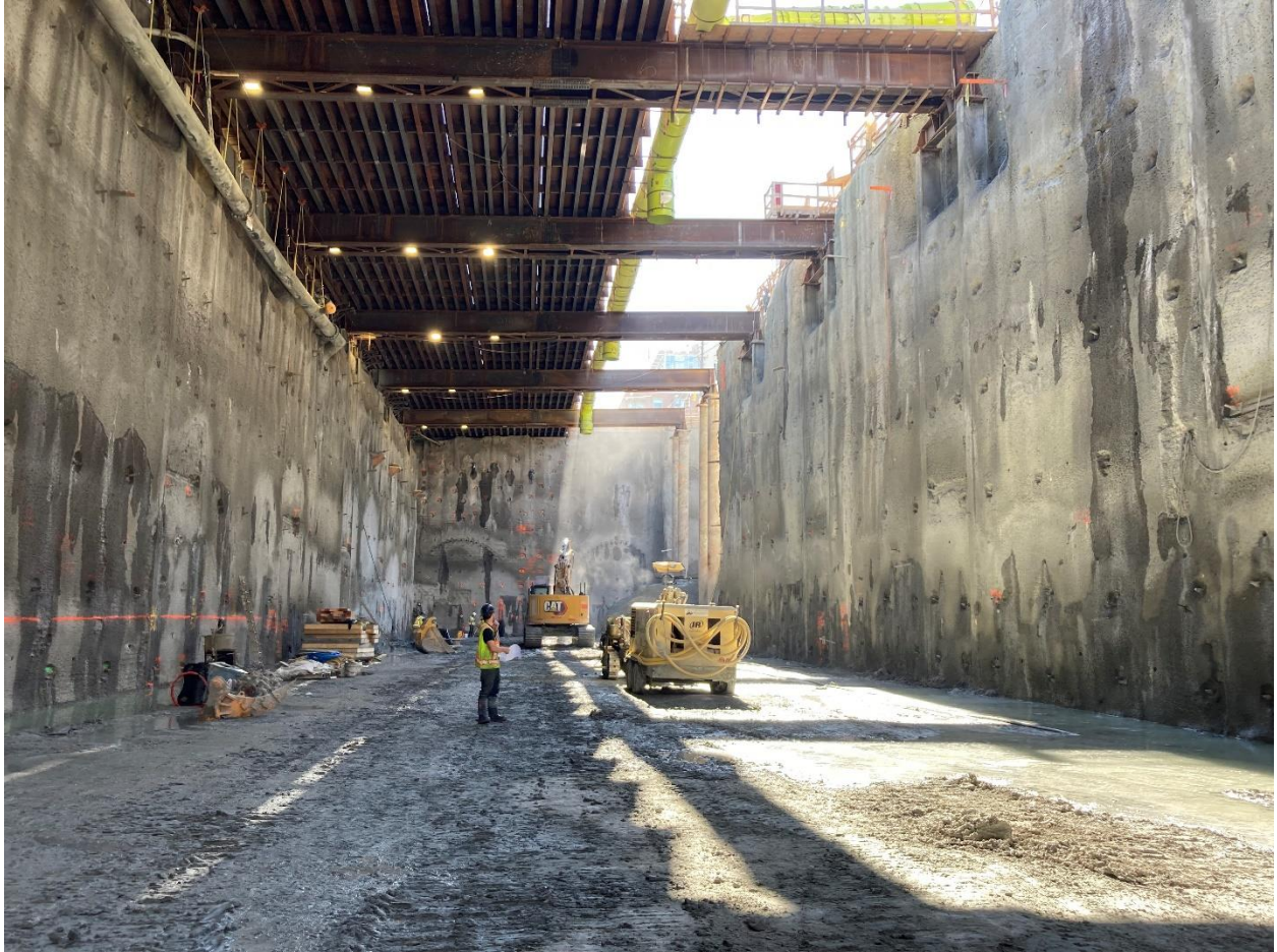
Figure 3: Mount Pleasant Station: Progressing with the excavation and shoring of the station box.