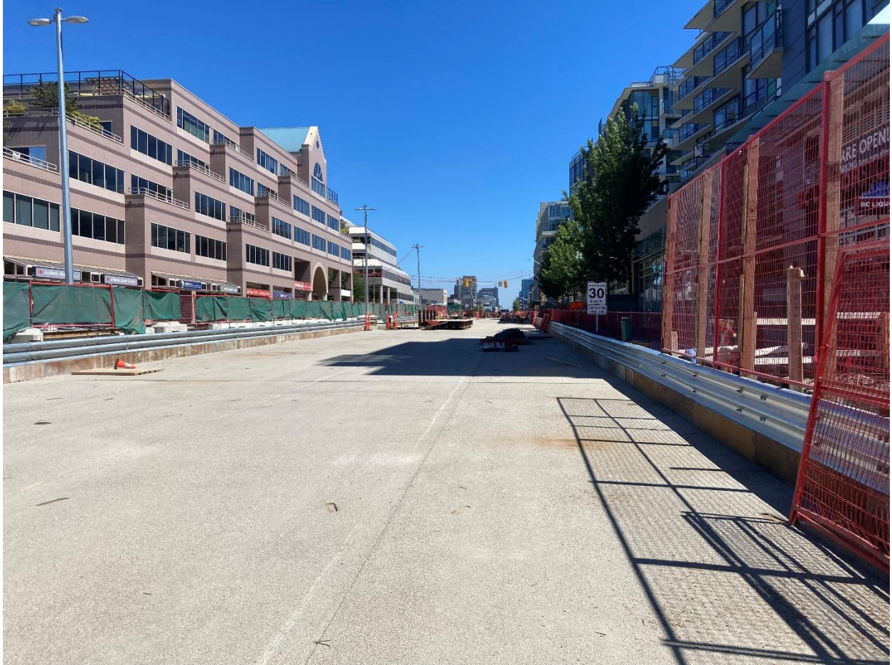
Figure 7: Arbutus Station: Progressing with the installation of traffic decking on Broadway between Arbutus and Cypress streets.