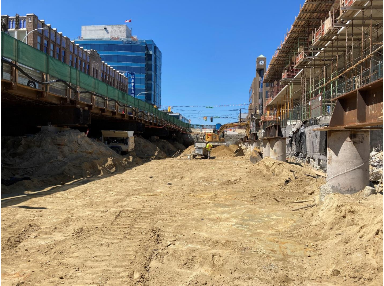
Figure 6: South Granville Station: Progressing with the excavation of the station box and installation of the supporting structure for additional traffic decking.