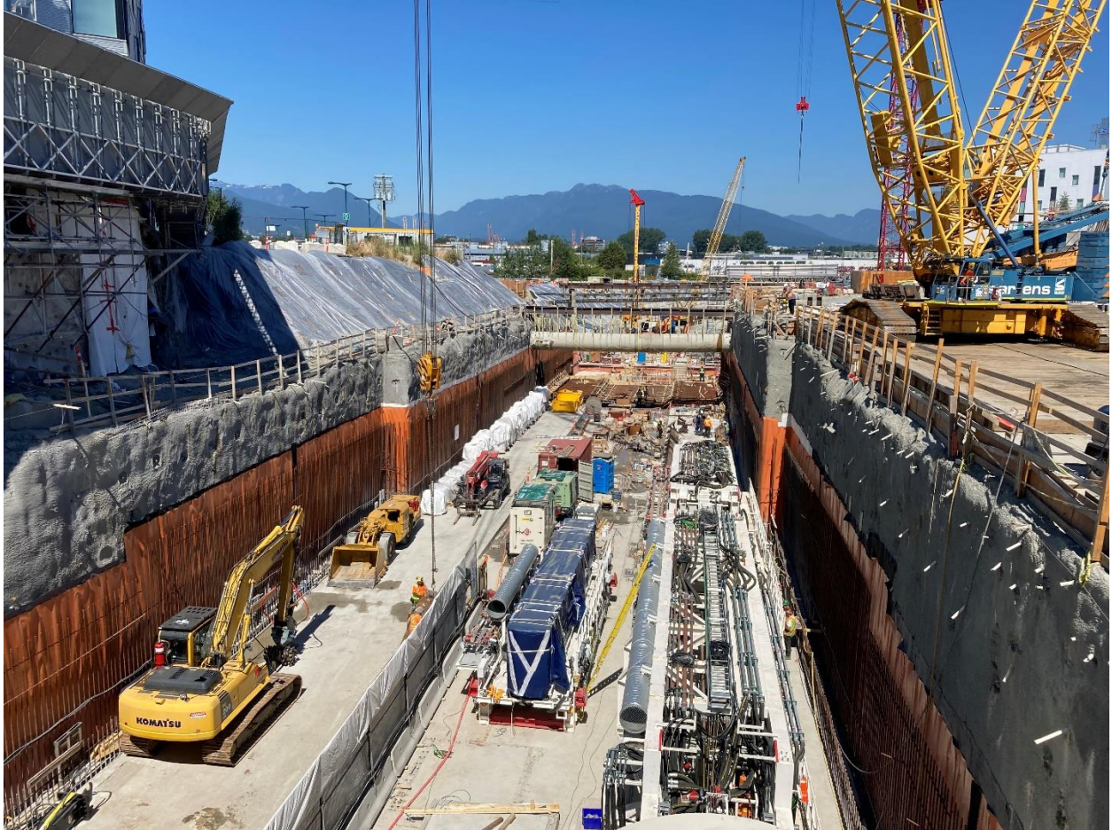
Figure 2: Great Northern Way-Emily Carr Station: Mobilizing for the mined tunnel, assembly of the Tunnel Boring Machine and progressing with the station box base slab.