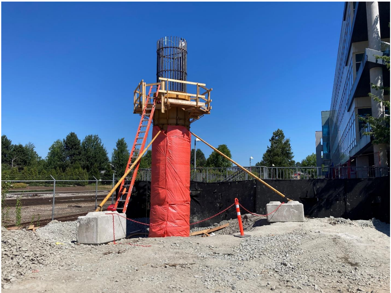
Figure 1: Elevated Guideway: Progressing with the installation of columns for the elevated guideway.