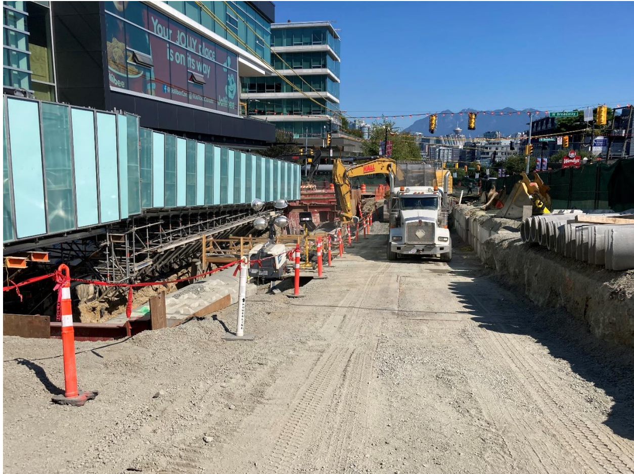
Figure 4: Broadway City Hall Station: Progressing with the relocation of the large diameter Capilano #5 pipe in order to install the underground station.