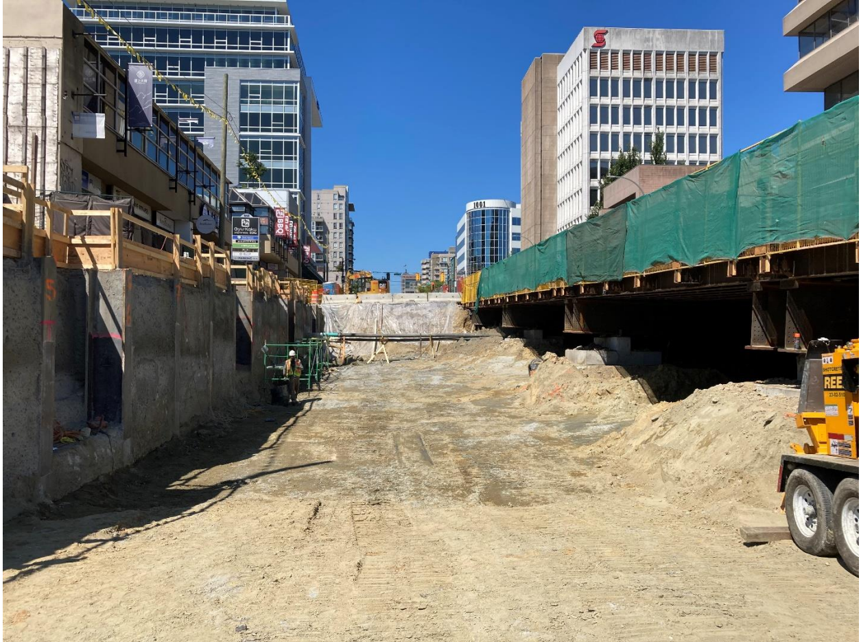
Figure 5: Oak VGH Station: Progressing with the installation of the supporting structure for the traffic decking girders.