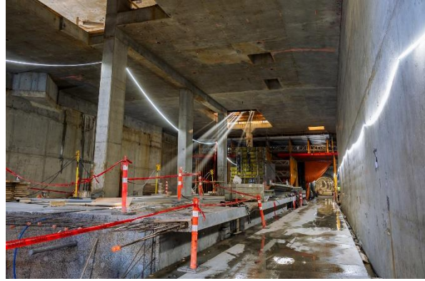
Figure 2: Great Northern Way-Emily Carr Station: Progressing with construction of the concourse-level floor and platform slab.