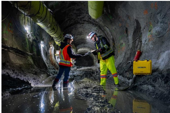
Figure 7: Arbutus Station: Preparing for structural works inside the tail track tunnels.