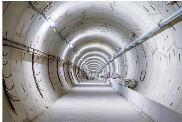
Figure 8: Tunnels: Progressing with construction of the concrete walkway wall in the tunnel near Mount Pleasant Station.