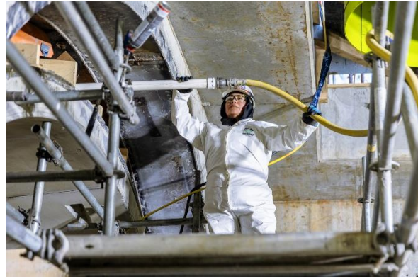
Figure 6: South Granville Station: Progressing with construction of the expansion joint between the station and the tunnel.