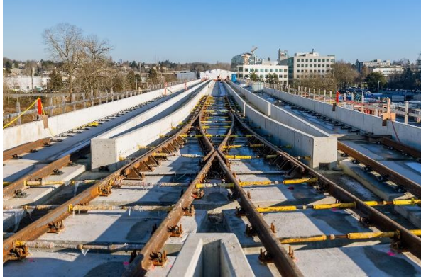
Figure 1: Elevated Guideway: Progressing with track installation.