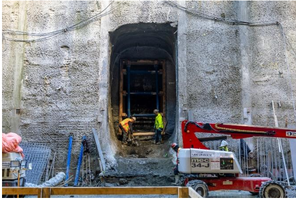
Figure 5: Oak-VGH Station: Completing the excavation for the emergency exit.