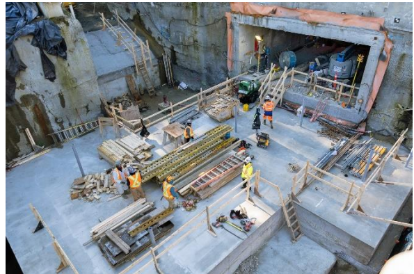
Figure 4: Broadway-City Hall Station: Progressing with the installation of the mud slab on the Canada Line platform level in the headhouse.