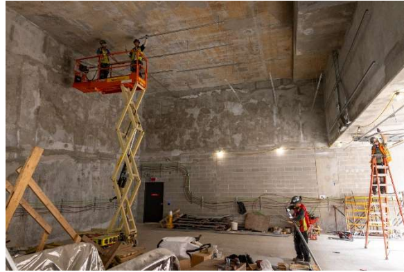
Figure 6: South Granville Station: Progressing with fit-out within the headhouse.