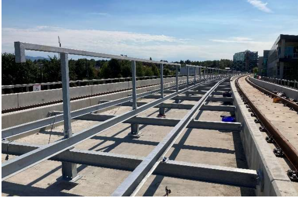
Figure 1: Elevated Guideway: Progressing with installing the walkway.