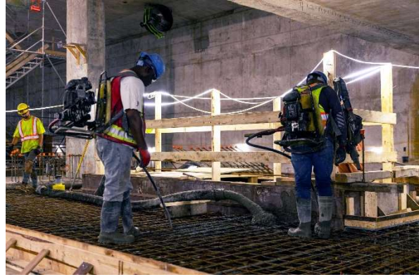
Figure 2: Great Northern Way-Emily Carr Station: Progressing with concrete pours to construct the platform slab.