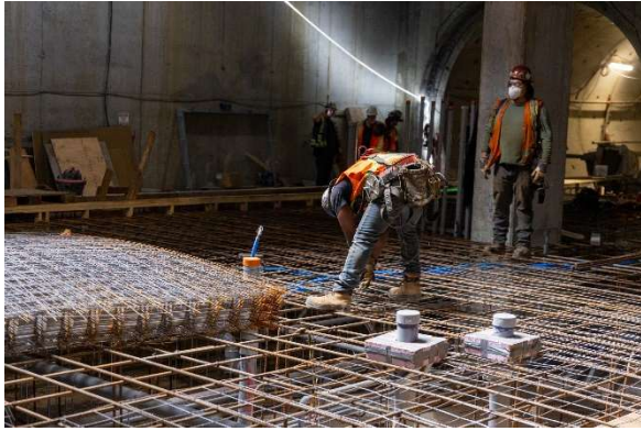
Figure 5: Oak-VGH Station: Progressing with rebar installation for the platform slab within the station box.