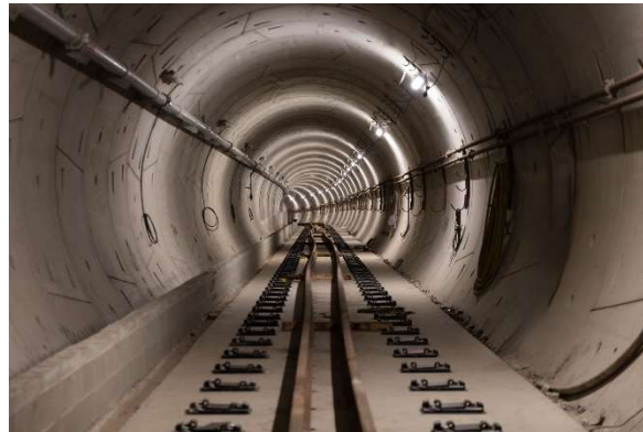
Figure 8: Tunnels: Progressing with pulling rail for track installation in the tunnels.