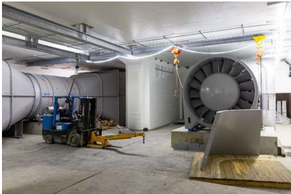
Figure 7: Arbutus Station: Progressing with fit-out and systems installation in the tunnel ventilation fan room.