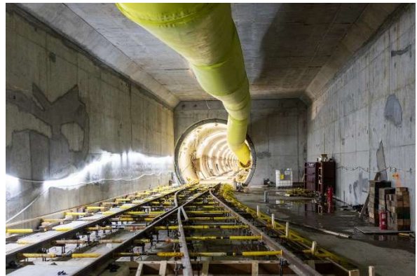
Figure 4: Broadway-City Hall Station: Progressing with installation and alignment of the trackwork in the crossover section.