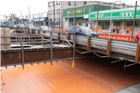
Figure 3: Mount Pleasant Station: Progressing with waterproofing on the completed roof slab.