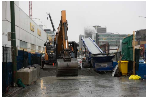
Figure 4: Broadway-City Hall Station: Progressing with backfilling the crossover box between Alberta and Yukon streets.