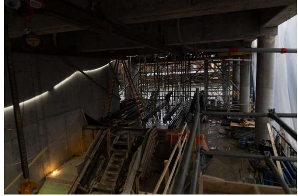
Figure 2: Great Northern Way-Emily Carr Station: Progressing with formwork and shoring removal in the headhouse.