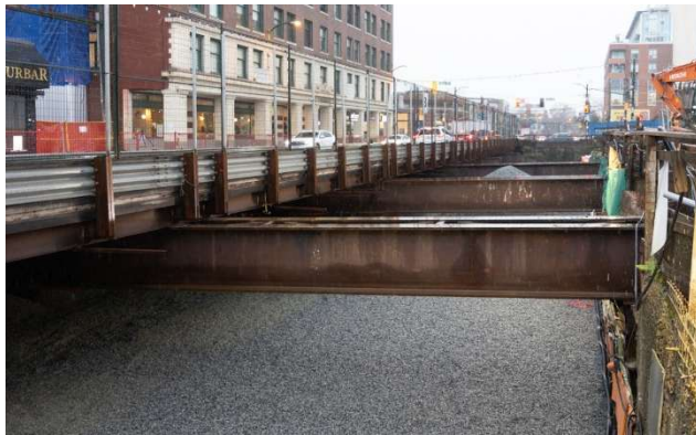
Figure 3: Mount Pleasant Station: Progressing with backfilling above the station box.