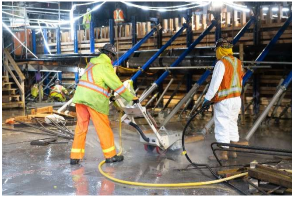
Figure 5: Oak-VGH Station: Waterproofing the station box roof.