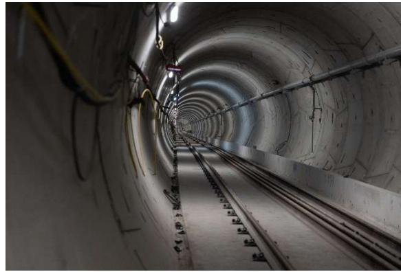
Figure 8: Tunnels: Progressing with alignment and installation of running rail near Arbutus Station.