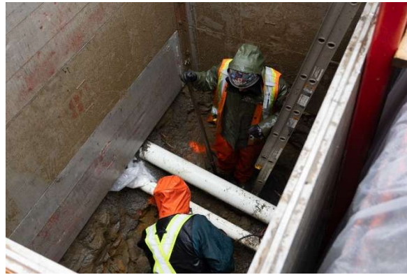
Figure 6: South Granville Station: Progressing with utility relocation work on Hemlock Street.