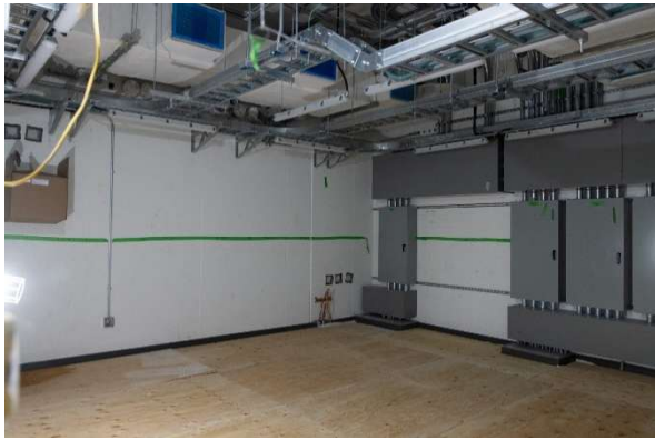
Figure 7: Arbutus Station: Progressing with station fit out of electrical, mechanical and plumbing systems.